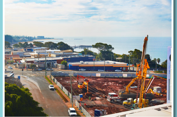
Construction begins! June 2009

Mid June saw the beginning of construction of one of the most dynamic projects in South East Queensland . This comes at a time when many major developments have been put on hold due to the financial crisis, creating a wealth of employment in Redcliffe and the greater Brisbane area. The building is being constructed by multi-award winning St Hilliers Contracting ( www.sthilliers.com.au ). As you can see from the adjacent photo, earthworks are well underway with the basement area excavations due for completion in August!