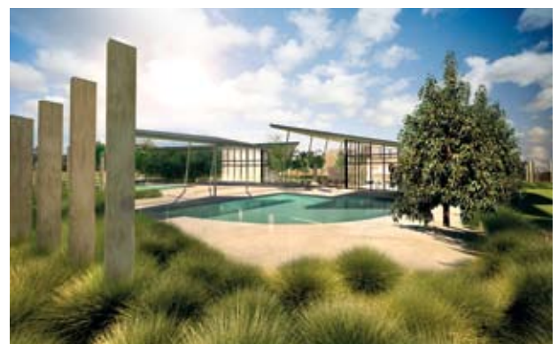
The Parc Recreational Club

The Parc will be released to the market over five stages. The first release comprising 40 residences, is on track to be launched in October 2008. The residential enclave is expected to be fully completed by 2010.